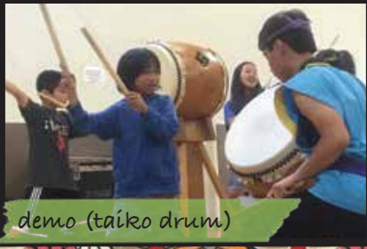
demo (taiko drum)