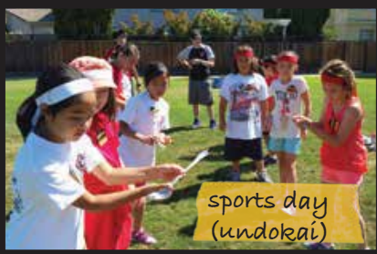
sports day (undokai)