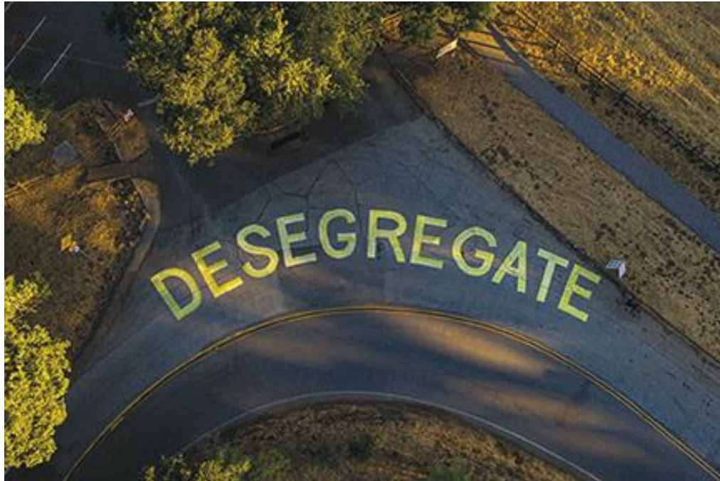
5 6 7 8 9 10 11 12 13 14 15 16 Figure 7

1 38. On the night of July 5, 2020, a small protest with approximately a dozen people 2 was held at the entry gate to the Park, including the painting of a sign on the roadway (with chalk- 3 based, washable paint) calling for the “desegregation” of the Park. The City used hundreds of 4 gallons of water to wash the chalk away by 7 a.m. the next morning.