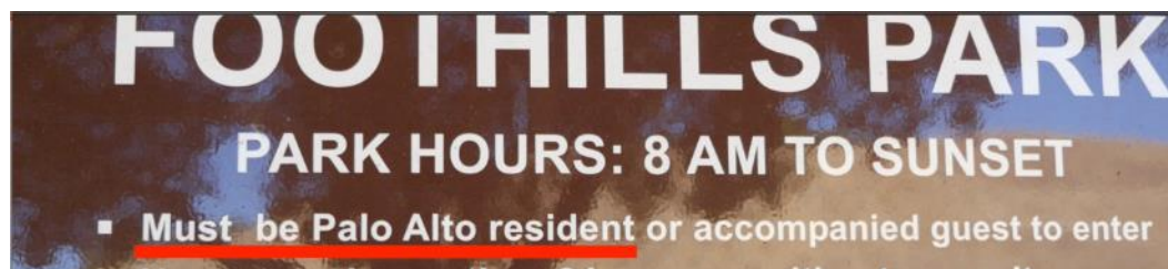
22 Figure 4: One of several Park entry signs.

15 32. In an attempt to deter non-residents from traveling to the Park, the City openly 16 publicizes the exclusionary Ordinance and related restrictions, which apply to entry and use of all 17 facilities, including group assembly and meeting facilities.