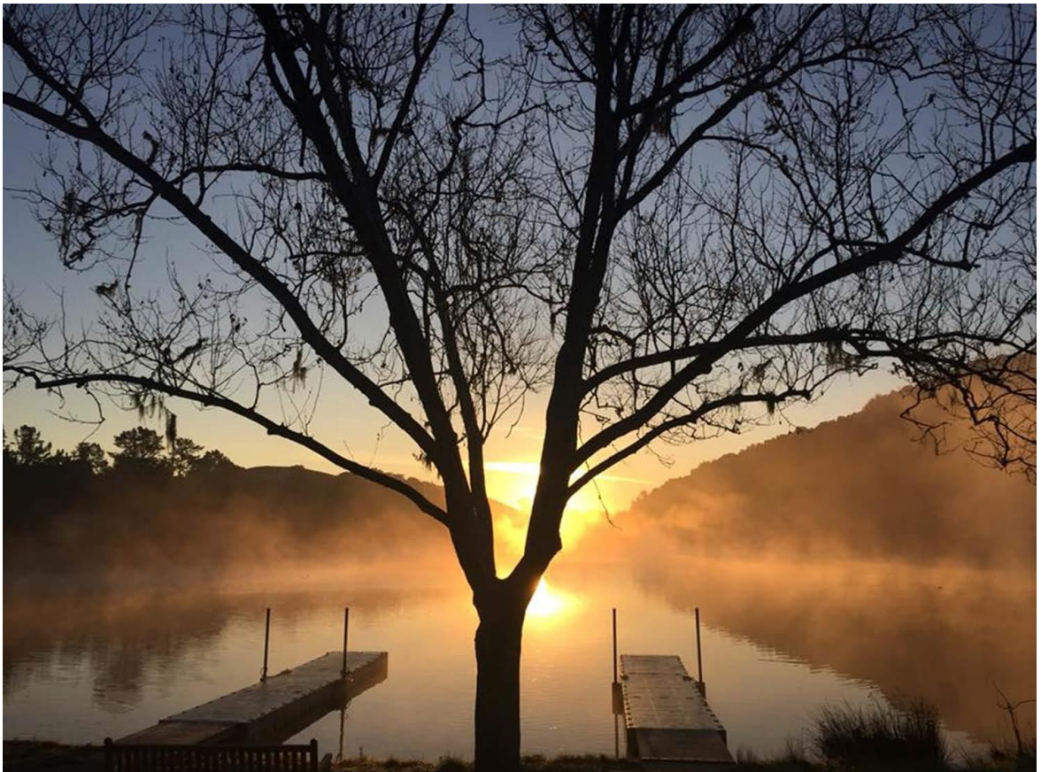
7 8 9 10 11 12 13 14 15 16 17 18 19 20 21 Figure 1: Boronda Lake: Foothills Park Presentation at City Council Meeting (Aug. 3, 2020)

1 25. The Park is a vast space that makes up 8.4% of the City’s total area. The Park was 2 dedicated in the same manner as all other City park land, as “reserved for park, playground, 3 recreation or conservation purposes.” The City encourages Palo Alto residents to use the Park’s 4 facilities, which include five picnic areas and barbecues, a campground, vast irrigated grass fields, 5 and an extensive trail network. The City also invites visitors to attend activities and programs led 6 by volunteers and City staff, and to fish and boat in the Park’s man-made Boronda Lake.