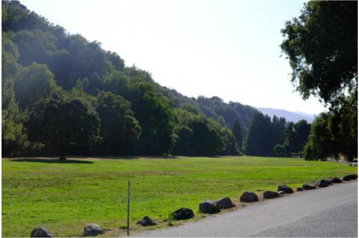
Figure 2: Irrigated Grass Fields, Foothills Park

1 2 3 4 5 6 7 8 9 10 11 12 13 14 15 16 17 18 19 20 21 22 23 24 25 26 27 28