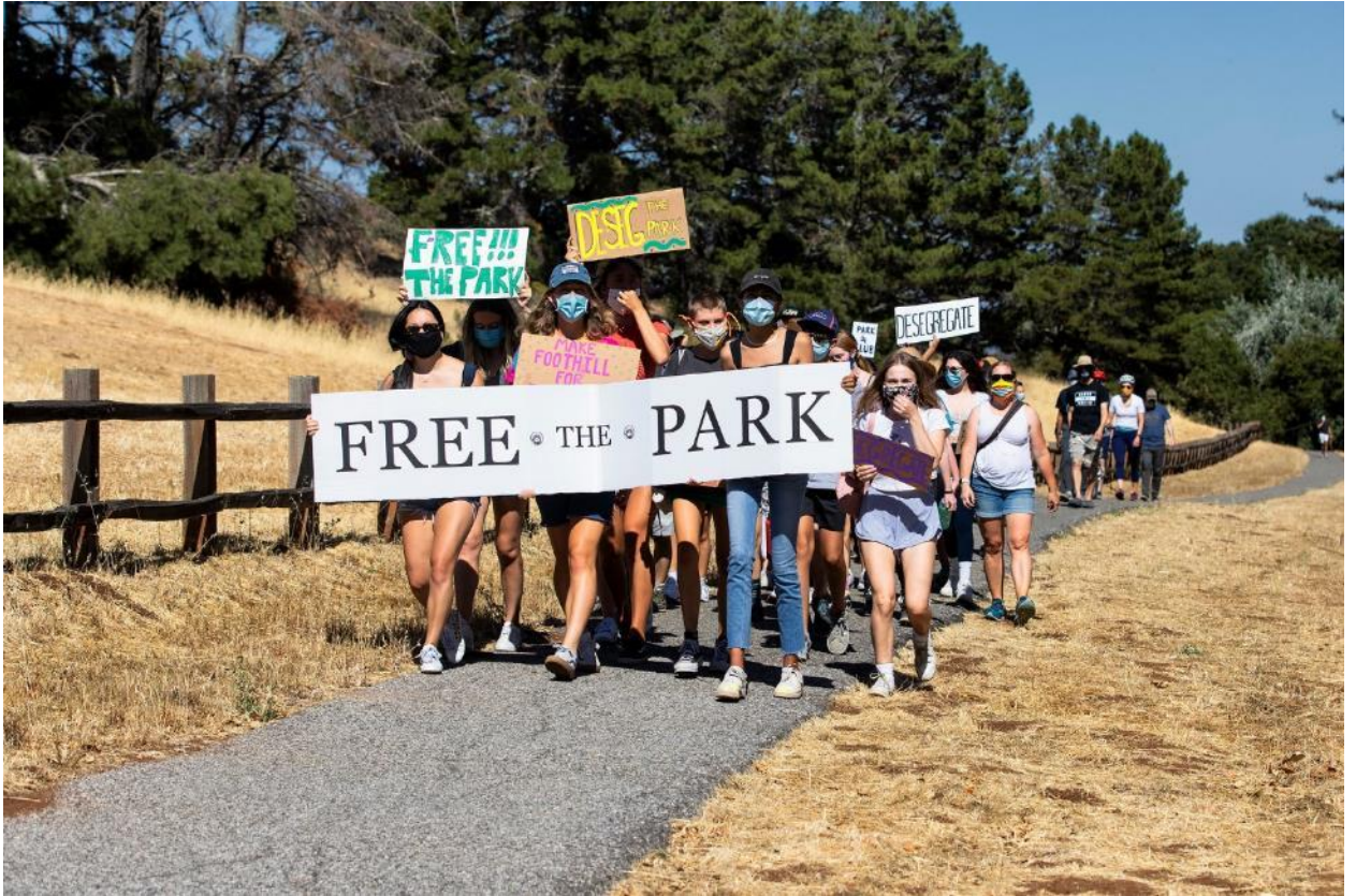
Figure 6: Photo credit Terry Scussel, Pro Bono Photo

1 36. On June 27, 2020, a small protest was held at the Park. Three persons who are 2 residents of Palo Alto were allowed to enter the Park and protest. At least three other persons, all 3 with protest signs in hand, were refused entry because they were not residents of Palo Alto.